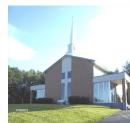
Sts. Simon & Jude