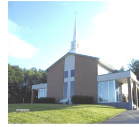
Sts. Simon & Jude