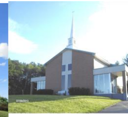
Sts. Simon & Jude