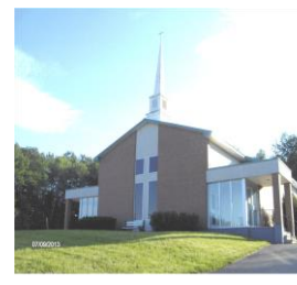
Sts. Simon & Jude