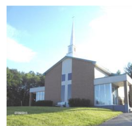
Sts. Simon & Jude